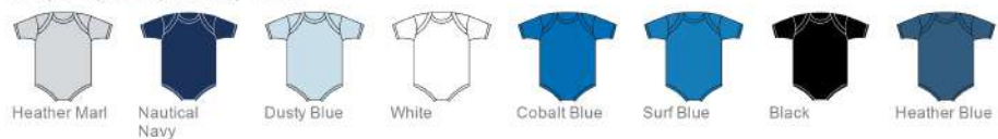
Heather Marl Nautical Navy Dusty Blue White Cobalt Blue Surf Blue Black Heather Blue