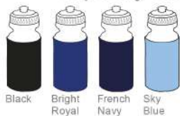
Black Bright Royal French Navy Sky Blue